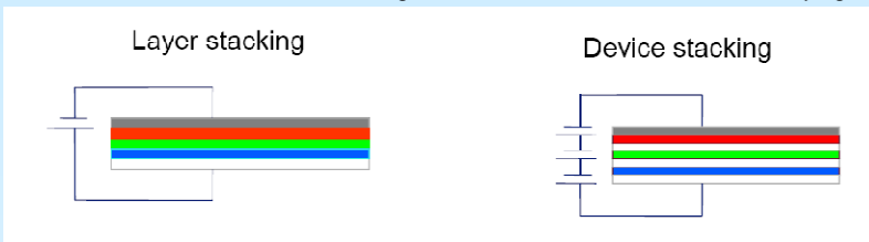
Fig. 2: White OLED in which different emitter layers are evaporated on top of each other in one device (left) and a so-called stacked device in which complete devices are evaporated on top of each other, connected by a special layer system (right). In the stacked device, each sub-unit emits in a different colour to create white emission.

The emission colour of the OLED is determined by the properties of the emitting molecules. White emission can be achieved by mixing the emission of different molecules, either red (R), green (G), and blue (B) or yellow (Y) and B in one device, an option that is not possible with inorganic LEDs. In practice, R, G, and B-emitting layers are evaporated on top of each other. One can also put different emitters in one layer, for instance R and G to achieve Y. By tuning different parameters (e.g. the structure and composition of the layers) one can choose the emission spectrum and colour point that is desired. In another approach, complete devices with different emission colours are stacked on top of each other. That is, all organic layers of an OLED as shown in Fig. 1 are evaporated, but instead of depositing the top cathode, a special connecting unit is evaporated. Then a second OLED, starting with the hole injection layer is being deposited on top. In practice it is sufficient to deposit two units, a B and a Y emitting one. The advantage of this approach is, since all OLED units emit light, that the total current of the device is reduced and thus the lifetime for a given luminance is better. We are studying both approaches in the OLED100.eu project. (see Fig. 2)