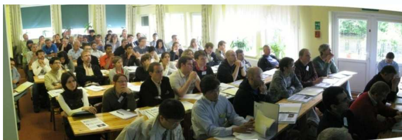
Fig. 1: The classroom was full

Dr. Dietmar Keiper (Aixtron/Germany): Organic vapour phase deposition (OVPD)