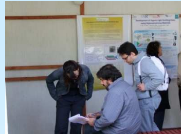
Fig. 3: Poster discussions

Leisure activities included a bonfire evening, a canoe afternoon and an excursion to the sanctuary Świąta Lipka.