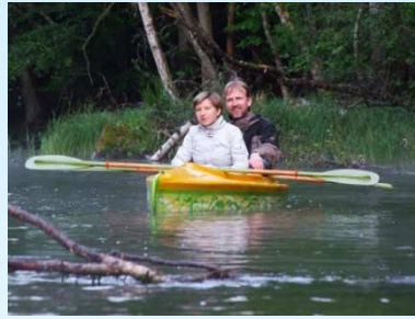
Fig. 2: Teacher and student working together