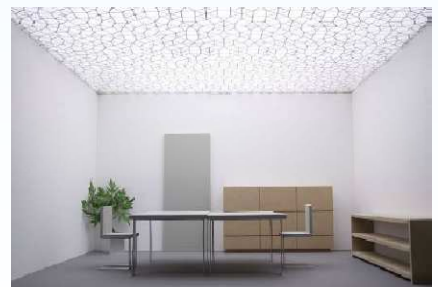
Office room model for aesthetical perception case study with ceiling consisting of square (left), hexagonal (middle), and ornamental-type OLED tiles.