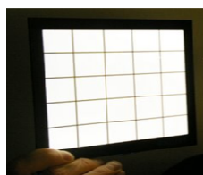
Fig. 3: Large-area OLED with shunt line structure that ensures a homogeneous emission.

There are two main challenges to increase the emitting surface area of OLEDs. The first is defects. The greater the area, the greater is the chance of having a defect that could kill the whole device. In OLED100.eu we are therefore working on short-resistant architectures and short-detection methods to make the devices more reliable. The second challenge is the delivery of identical current density to all parts of the device in order to assure uniform luminance over the entire device area. We are developing shunt metal lines that distribute the current more evenly over large areas. Such a shunt line structure can be seen in the OLED in Fig. 3.