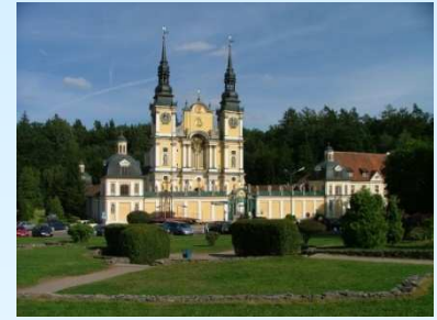
Fig. 3: The sanctuary Świąta Lipka