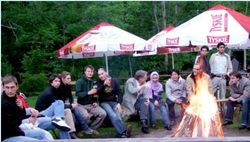
Fig.1: Picnic bonfire

Leisure activities included a bonfire evening, a canoe afternoon and an excursion to the sanctuary Świąta Lipka.